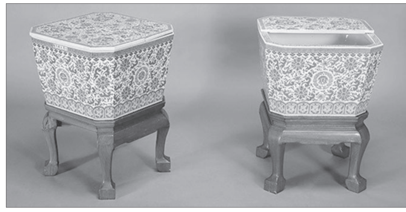
Above: A pair of underglaze blue lidded ice chests that bore Guangxu six-character marks were estimated at $4,000 to $6,000, but sold at more than 12 times that amount to achieve $76,700.