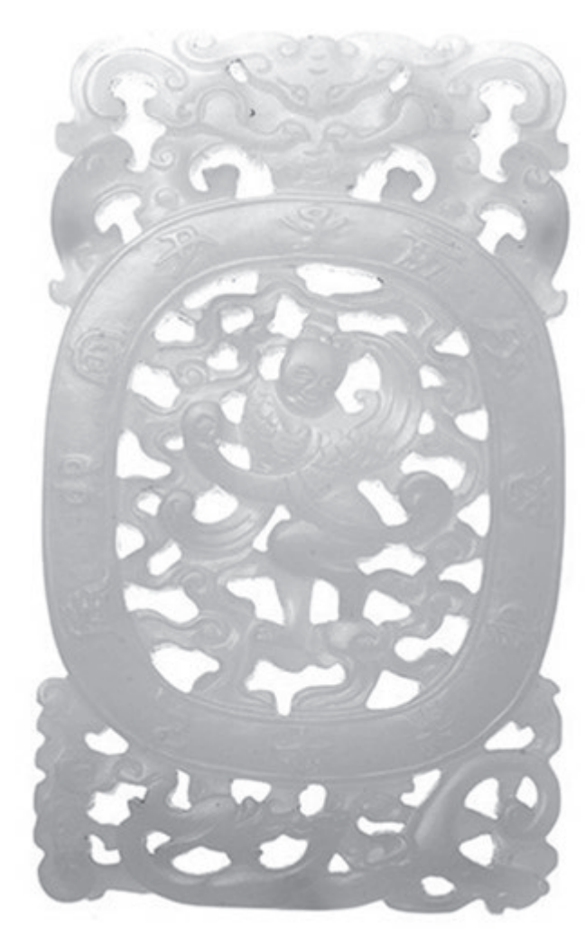
Above: An 18th century reticulated white jade plaque that was finely carved in openwork with a winged Daoist figure was estimated at $4,000 to $6,000 and sold for $56,050.