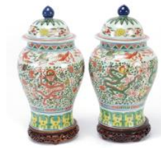
705 Pair of Chinese Famille Verte Porcelain Jars with Covers on Wood Stands. {Approximately Height: 16 inches}.