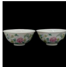
642 Pair of Chinese 19th Century Famille Rose Floral Bowls. Painted in enamels with a delicate floral study, the base with Qianglong four-character reign marks. {Diameter: approximately 5 inches}.