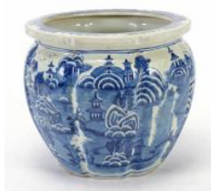
693 Chinese Blue and White Porcelain Fluted Planter. {Approximately Height: 12 inches}.