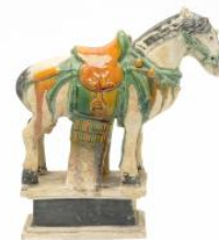
621 Chinese Tang Style Pottery Caparisoned Horse. {Approximately 12 inches Height}. Age related wear and lose.