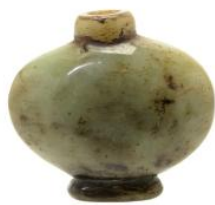
572 Green Jade Snuff Bottle. {Approximate Height: 2 inches}.