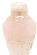
575 Crystal Snuff Bottle {Approximate Height: 3 1/4 inches}.