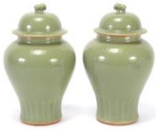
700 Pair of Chinese Celadon Porcelain Jars with Covers. {Approximately Height: 17 1/4 inches}.