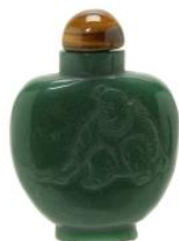
573 Apple Green Jade Snuff Bottle with Tiger Eye Stopper. {Approximate Height: 2 inches}.