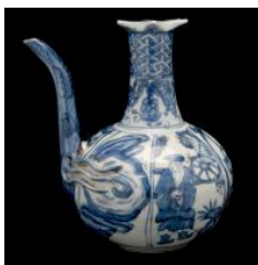
677 Ming Blue/White Ewer.

Of globular body rising to a tapering neck surmounted with a six-pointed mouth rim; the shoulder set with an upright curving spout; the body painted with five panels decorated with figures, garden rocks, and twisted vines.