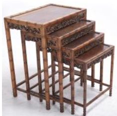
773 Set of Four Chinese Bamboo Style Nesting Tables with Carved Floral and Bamboo Motif. China. {Approximately 28 1/2 inches Height}.