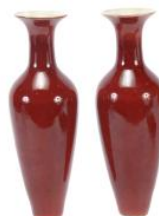
698 Pair of Chinese Oxblood Porcelain Amphora. {Height: Approximately 9 inches}.