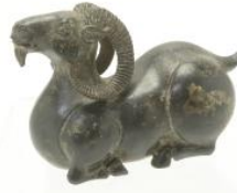
715 Chinese Patinated Bronze Recumbent Ram. The recumbent ram is cast with its head looking forward, its legs tucked under its body, its facial features, mane and tail are all finely detailed. {Length approximately 4 inches}.