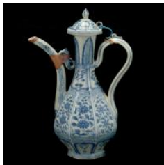
678 Blue/White Octagonal Ewer with Cover.

The pear-shaped body rising to a waisted neck and an everted rim; set on one side with a curved spout, joined to the neck by a double-ring strut; opposite the arched strap handle, the body decorated with eight panels each painted with floral sprays: neck is encircled by bands of upright leaves, fitted with a matching doomed cover