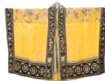
776 19th Century Chinese Imperial Yellow Ground Taoist Priest Dragon Robe. Jiangyi. China.