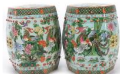
691 Pair of Chinese Porcelain Garden Seats. {Approximately Height: 19 inches}.