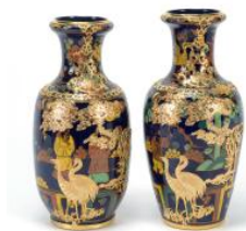
699 Pair of Chinese Polychrome Porcelain Vases with Dore Bronze Mounts. {Height: Approximately 15 3/4 inches}.