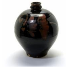
681 Black Glazed Russet Splashed Jar.

The ovoid body rising from a recessed base to a short flanged neck; covered with a lustrous brownish-black glaze splashed in russet with abstract floral motifs. {Approximate Height: 9.3 inches}. Provenance: Collection of Dr. Reri Fujimura, Berkeley, California