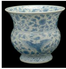
679 Ming Blue And White 'Phoenix' Zhadou.

Of rounded body with trumpet-shaped neck and splayed foot; painted over the interior and exterior of the neck and the body; with six flying phoenixes among scrolling lotus. The base is inscribed with a four-character reign mark.