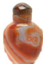
576 Red Agate Snuff Bottle. {Approximate Height: 3 1/4 inches}.