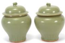
702 Pair of Chinese Celadon Porcelain Jars with Covers. {Approximately Height: 15 1/2 inches}.