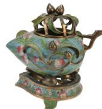
708 Chinese Bronze Cloisonné Enamel Peach Form Censer. China. The body is decorated with scrolling peach on a turquoise ground, supported on a two tiered open stand with bracket legs, the reticulated gilt-metal cover formed as curling peach leaves surmounted with a peach final and fitted with a gilt metal long handle. {Approximately 20 1/2 inches tall}.