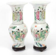
704 Pair of Chinese Famille Verte Porcelain Vases on Wood Bases. {Height: Approximately 16 1/2 inches}.