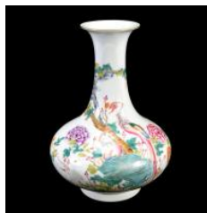
682 Famille-Rose 'Peony' Vase.

The compressed globular body rising to a tall tapering neck with flared rim; brightly painted around the exterior with peony plants bearing colorful blossoms; amid garden rock with phoenixes the foot. The base has a seal mark in iron red.