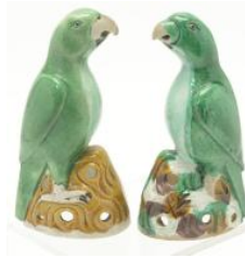
619 Pair of Chinese Green Glazed Ceramic Parrots. 17th Century Style. {Approximately 87 1/2 inches Height}.