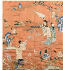
785 Chinese Framed Embroidery Panels Group of Five