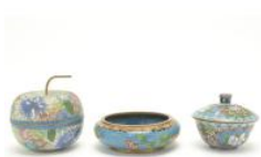
713 Three Chinese Cloisonné. China. Comprising a Cloisonné, Apple, Tea Cup; brush washer. {Diameter of the Largest: 5 inches}.