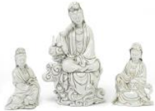
701 Lot of Three Chinese Blanc de Chine Porcelain Guanyin. {Height: Approximately 8 1/2 inches}.