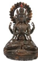
718 Tibetan Bronze Four Arm Shadakshari. The four-armed Bodhisattva seated in dyanasana on a lotus base, with the principle hands folded in anjalinudra and the upper hands in karanamudra, wearing a dhoti and beaded jewelery and a five crowned ornate headdress, with a flaming mandorla rising from the shoulders. {Approximately 19 1/4 inches height}.