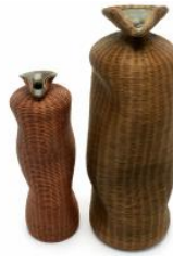
793 Two Contemporary Japanese Ceramic Vessels Encased in Woven Wire. Elongated cylindrical forms with everted lips, encased in "basket woven" wire. {Height of the tallest: 17 1/2 inches}. Provenance: From a San Francisco apartment designed by Steven Volpe. Purchased from William Lipton Gallery, New York.