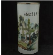
620 Chinese Republic Porcelain Hat Stand with inscriptions. {Approximately 11 inches Height}.