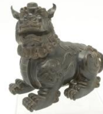
716 Chinese Patinated Bronze Qilin Form Censer. Cast as a mythical beast shown seated with hinged head turned to the side and mouth open, with a horn in the back center of the head. {Length: 7 1/2 inches (19.1 cm)}.