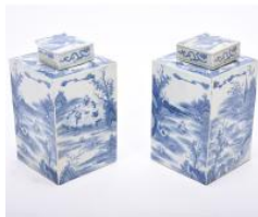
690 Pair of Chinese Blue and White Porcelain Tea Caddies with Covers. {Approximately Height: 12 1/2 inches}.