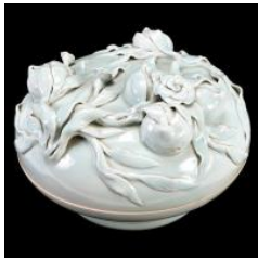
617 Large Chinese Celadon Glazed Peach Porcelain Circular Box. Of compressed rounded form, the cover is decorated with five molded large peaches on branch. The box evenly covered with light blue celadon glazed; unglazed base. {Approximately 14 1/4 inches diameter}.