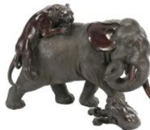
796 Japanese Large Cast Red Bronze Elephant and Lion Group. {Approximately 14 inches width}.