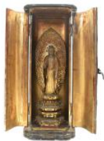
792 Japanese lacquer shrine with standing Buddha. The wood, gold-leaf, and lacquer zushi (small Buddhist shrine) shrine with hinged double doors opening to reveal a gilt-painted standing Bodhisattva, Senju Kannon. {Approximate height, 31 inches}. [Condition: Some loss lacquer, wear.]