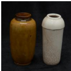
637 Two Small Chinese Monochrome Ceramic Bottles.