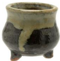
638 Chinese Small Brown and Gray Glazed Tripod Censer. Ming Style. {Height: Approximately 2 1/4 inches}.