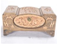
770 Heavily Carved Camphor Wood Figural Asian style Chest