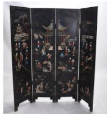
772 Chinese Black Laquer Four Panel Coromandel Floor Screen with Village Courtyard Scenery {Approximately 72 inches height}. Age related wear and loss.