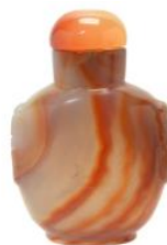
577 Agate Snuff Bottle. {Approximate Height: 3 1/4 inches}.