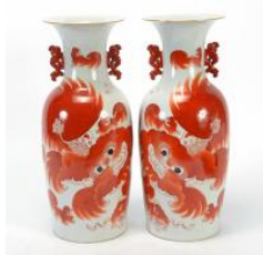
692 Pair of Chinese Orange Foo Dog Baluster Porcelain Vases. {Height: approximately 22 1/2 inches}.