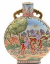
623 Chinese Export Porcelain Moon Flask. Depicting European subject hunting scene. {Approximately 10 inches height}.