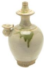
636 Chinese Tang Style Celadon Glazed Wine Jar. {Approximately Height 8 1/2 inches}.