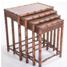
774 Set of Four Chinese Bamboo Style Nesting Tables. With bamboo and carved floral design aprons. {Approximately 26 inches height}.