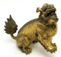
717 Sino Tibetan Gilt Bronze Lion Censer. Cast with its head looking upward, its right front paw and bushy tail raised. {Approximately Height 10 1/4 inches}.