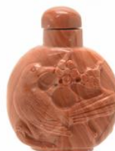
578 Hardstone Jade Snuff Bottle {Approximate Height: 2 inches}.