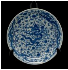
676 Ming Blue/White 'Dragon' Dish, Cheng-Te Period.

Of rounded curving sides; painted with a central medallion enclosing a five-clawed dragon writhing amidst scrolling stems of lotus flowers and trefoil leaves; the cavetto with two further writhing dragons; the reverse similarly decorated. The base has a four-character Cheng-Te mark within a double-circle.