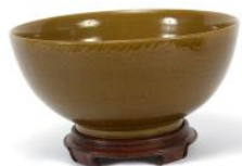
695 Large Chinese Tea Dust Glazed Porcelain Bowl on a Wood Base. {Approximately Diameter 16 inches}.