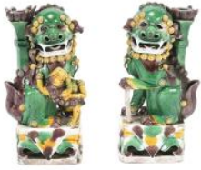
614 Pair of Chinese Green and Yellow Glazed Ceramic Foo Dogs. 17th Century Style {Approximate Height: 9 inches}.