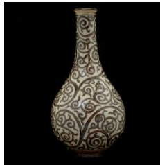
680 Painted Jizhou Pear-Shaped Vase.

Of pear form with elegant tall tapering neck and lipped rim; exquisitely painted in brown slip against a white ground with scrolling foliate stems. The unglazed base reveals the whitish buff ware.