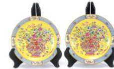
706 Pair of Chinese Famille Jaune Porcelain Plates. {Diameter: approximately 8 1/4 inches}.