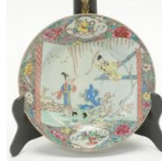
641 Chinese 18th Century Export Famille Rose Figural Plate. Diameter: Approximately 9 1/4 inches}.