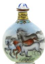
574 Cloisonné Snuff Bottle with Stopper. {Approximate Height: 3 1/4 inches}.