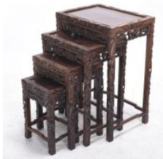
771 Set of Four Chinese Rosewood Nesting Tables with Carved Dragon Motif. {Approximately 28 inches height}.