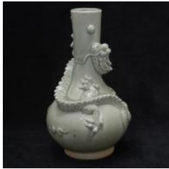
635 Chinese Tang Style Celadon Glaze Dragon Bottle Vase. {Approximately 7 inches height},