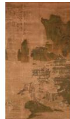
787 Large Hanging Scroll, Song Dynasty