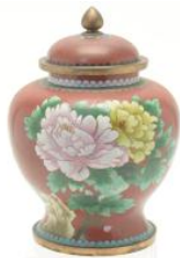
712 19th Century Cloisonné Baluster Vase with Cover. {Approximate Height: 10 inches}.