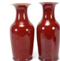
694 Pair of Large Chinese Oxblood Porcelain Baluster Vases. {Approximately Height: 21 inches}.