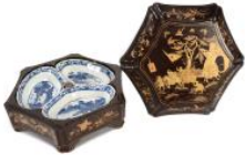
615 Chinese Set of Three Blue and White Porcelain Sweet Meat Dishes In Lacquer Box. Comprising set: three blue and white porcelain sweet meat condiment Dim Sim dishes of seashell form; decorated with flower designs, bands, and landscape cartouches. Set in a fitted brown lacquer gilt wood box. {Box, Approximately 15 inches diameter }.