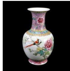
643 20th Century Chinese Famille Rose Vase. China. Depicting birds and flowers. {Approximately 8 1/4 inches height}.