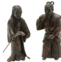
794 Pair of Japanese Red Bronze Man and Woman. {Approximate Height: 9 inches}.