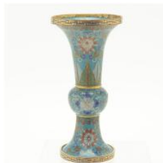
714 Chinese 19th Century Cloisonné Gu Form Vase. 7 1/4 inches Height.