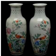
616 Pair of Chinese Famille Rose Vases. {Approximately 9 inches height}.