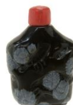
580 Black and White Jade Snuff Bottle with Coral Top. {Approximate Height: 2 inches}.