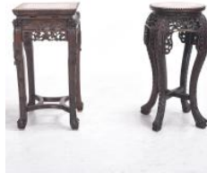
775 Two Chinese Carved Rosewood Plant Stand with Inset Pink Marble Top. Comprising a circular stand and a square stand. {Approximately 22 1/2 inches height}.