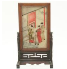
786 Chinese Marble insert table screen with stand. Late 19th to Republic period, Depicting a school in landscape scene. {Approximately 10 inches height}.