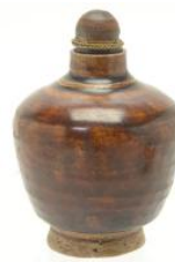
640 Chinese Brown Glazed Ceramic Song Style Herb Medicine Bottle. {Height: Approximately 3 1/2 inches}.