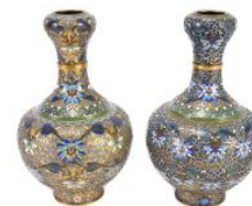
709 A Pair of Chinese Cloisonné Garlic Head Floral Vases. China. {Approximately 10 inches Height}.