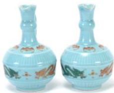
703 Pair of Chinese Celeste Blue Porcelain Water Pots. {Approximately Height: 10 1/2 inches}.