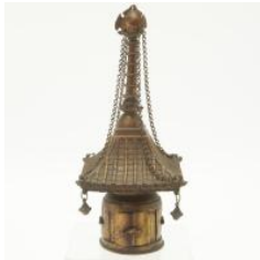
711 Tibetan Gilt Bronze Stupa. {Approximately 10 1/4 inches Height}.