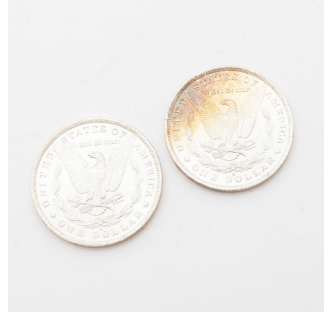
3530 US Lot of Two Rolls of 20 1884 (O) Morgan Dollars, UNC Condition. $1200 / $1400