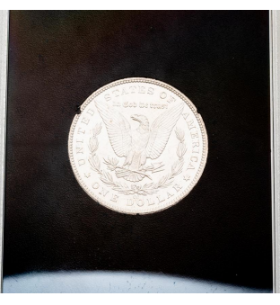
3565 US 1883 (CC) Morgan Dollar UNC with Box and COA. $300 / $400