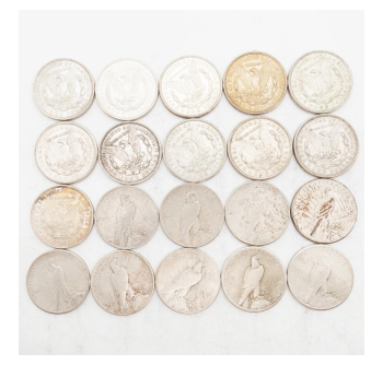
3552 Lot of 20 US Silver Dollars, Morgan 11, Peace 9, Mixed Condition, Including 1921-20. $300 / $400