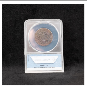
3627 US 1803 | Cent Anacs VF20 SM Date LG Fraction $300 / $400