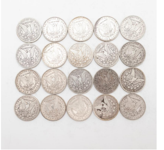
3548 Lot of 20 US Morgan Dollars, Mixed Condition, Including 1896-7, 1897-13. $300 / $400