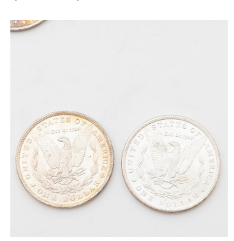
3529 US Lot of Two Rolls of 20 1884 (O) Morgan Dollars, UNC Condition. $1200 / $1400