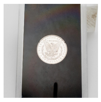
3564 US 1882 (CC) Morgan Dollar Proof Like UNC with Box and COA. $400 / $500