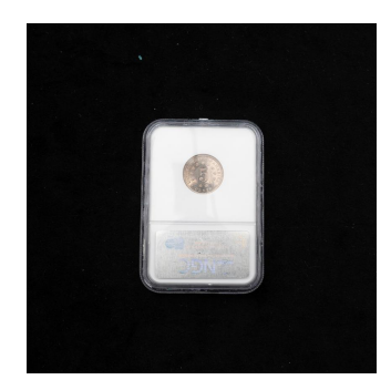
3625 US 1871 Shield 5 Cent NGC PF63. $300 / $400