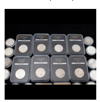
3619 US Half Dollars 90% Silver (19) Common Dates Mixed Conditions, Including Walking Liberty (1), Franklin (16), Kennedy (2), Kennedy 40% Silver (17), Dimes 1964 Proof 70-2. $300 / $400