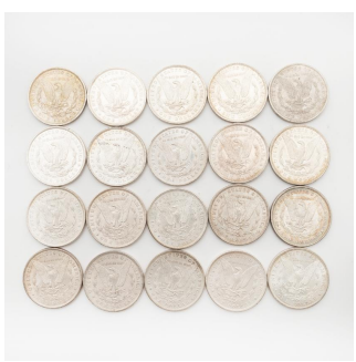
3556 US Morgan Dollars (20) AU-UNC Condition Including: 1883, 1883 (O) -2, 1884, 1884 (O)-5, 1885, 1885 (O)-3, 1886, 1886 (O)-2, 1887-4. $600 / $700