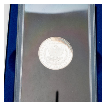
3562 US 1881 (CC) Morgan Dollar UNC with Box and COA. $500 / $600