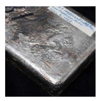
3603 Silver Bar Weighing 109.81 oz $1600 / $1800