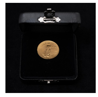
3607 US 1987 $10.00 Gold Bullion Coin UNC Condition $400 / $600