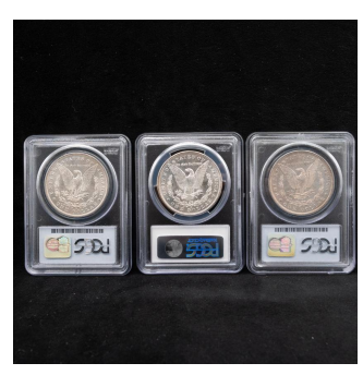
3612 US Morgan Dollars (3); 1880 (S) PCGS MS 63, 1883 (O) MS 63, 1884 (O) MS 64. $300 / $400