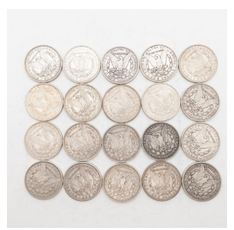
3550 Lot of 20 US Morgan Dollars, Mixed Condition, Including 1901-1, 1902-2, 1904-1, 1921-16. $300 / $400