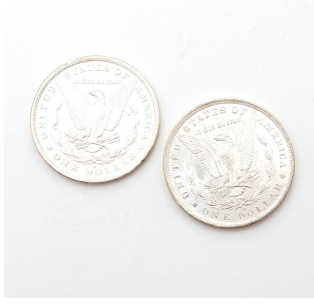
3526 US Lot of Two Rolls of 20 1884 (O) Morgan Dollars, UNC Condition. $1200 / $1400

Including: Half Dollars 1845, 1905 (S); Quarters Liberty Seating (2) Liberty Heard (21) Unresearched. $300 / $400