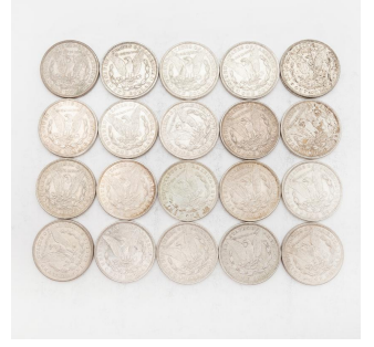
3551 Lot of 20 US Morgan Dollars, Mixed Condition, Including 1921-20. $300 / $400