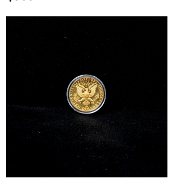
3513 US1994(W) $10.00 Olympic Commemorative Gold Coin $600 / $800