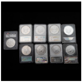
3620 US Silver Eagle $1.00 Bullion Coins (9) Certificate MS 69-7, MS 70-2. $300 / $400