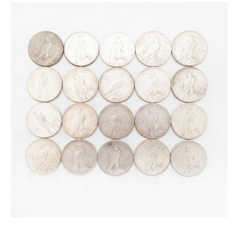
3554 US Peace Dollars (20) Common Dates, Mixed Condition. $300 / $500