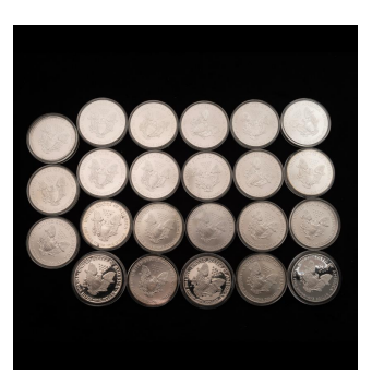
3621 US Silver Eagle $1.00 Bullion Coins (23). $450 / $550