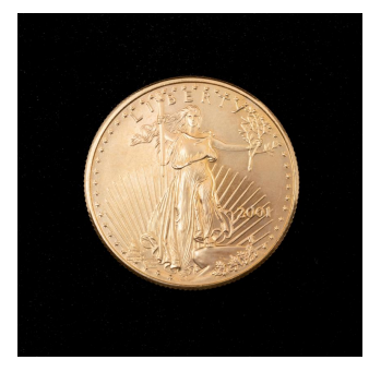
3606 US 2001 $25.00 Gold Bullion Coin UNC Condition $800 / $1000