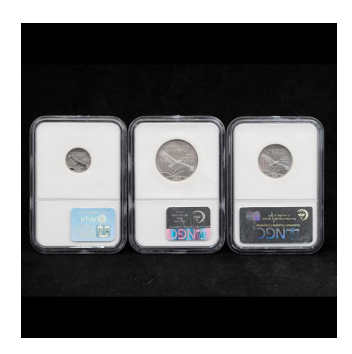
363 I US Platinum Bullion Coins (3) Including $10.00 MS 70, $25.00 MS70, and $50.00 MS69. $800 / $1000