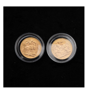
3622 Great Britain 1925 and 1927 Gold Sovereign. $700 / $900