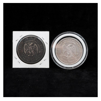
3630 US Trade Dollars (2) 1887 (S) VF, 1878 (S) VG Condition $400 / $600