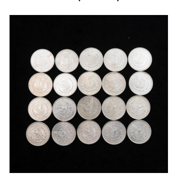
3646 US Roll of 20 Morgan Dollars Including 1880-3, 1881 (S), 1881 (O), 1883 (O), 1884 (O), 1885, 1885 (O), 1887m 1888, 1889, 1898, 1921-7 AL in BU Condition $800 / $1000