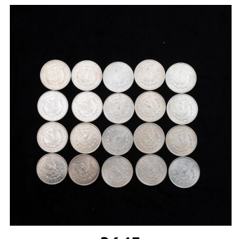
3645 US Roll of 20 1921 Morgan Dollars BU Condition $800 / $1000

US Silver Commemorative Coins (9) Including 2001 (D) Buffalo MS 69, 2004 Lewis and Clark PR 69, 2013 5 Star Generals PR 70, 2014 Baseball MS 70, 2015 (W) March of Dimes PR 70, 2016 Pearl Harbor MS 70, 2006 $100.00 Union Gem PR, 2007 James Blongarce Gem PR, and 2009