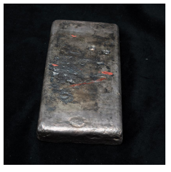
3581 Silver Bar Weighing 108.5 oz $1500 / $1800