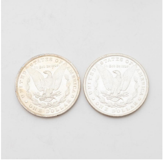
3533 US Lot of Two Rolls of 20 1884 (O) Morgan Dollars, UNC Condition. $1200 / $1400