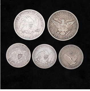
3638 US Silver Coins (5); 1875 (CC) Half Dollar VG,1900 (S) Half Dollar VF, 1838 Quarter Fine, 1860 (O) Quarter XF and 1917 Quarter VF $300 / $400