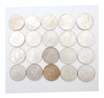
3558 US Silver Dollars (20) AU-UNC Condition Including Morgan (7), 1900-3, 1901 (O)-3, 1921 Peace-13, 1922-12, 1922 (S). $500 / $600