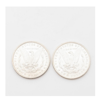
3528 US Lot of Two Rolls of 20 1884 (O) Morgan Dollars, UNC Condition. $1200 / $1400