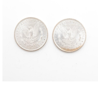
3525 US Lot of Two Rolls of 20 1884 (O) Morgan Dollars, UNC Condition. $1200 / $1400