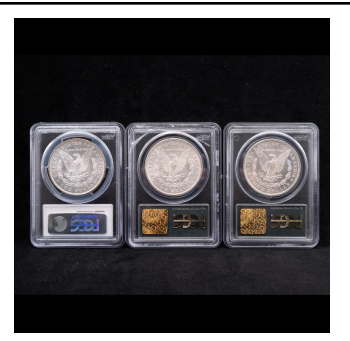
3611 US Morgan Dollars (3), 1879(S) PCGS MS 64, 1880(S) MS 63, 1884(O) MS 62. $300 / $400