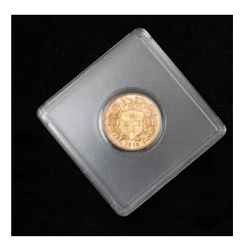
3609 Switzerland 1935 20 Franks Gold Coin UNC Condition $400 / $500