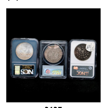
3637 US Morgan Dollars (3), 1878 (CC) XF-45, 1879 (CC) NGC Circulated, 1880 NGC UNC Details. $300 / $400