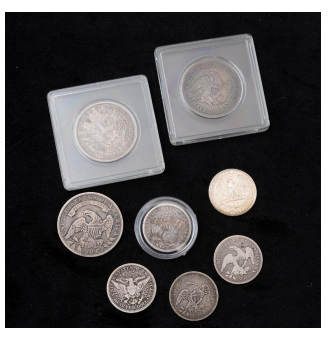
3516 US Silver Coins Including 1835-50 cents, 1854-50 cents, 1903 (S) Half Dollar, 1831-25 cent, 1835-25 cent, 1915 (S) Quarter, 1932(S) Quarter and 1883 Hawaii 1/4 Dollar $450 / $550