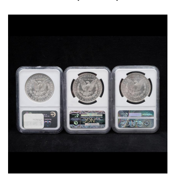
3610 US Morgan Dollars (3); 1880 (S) N6C MS 63, 1882 (S) MS64+, 1904 (O) MS63. $300 / $400