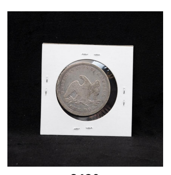
3629 US 1843 Liberty Seated Dollar VG Condition $300 / $400