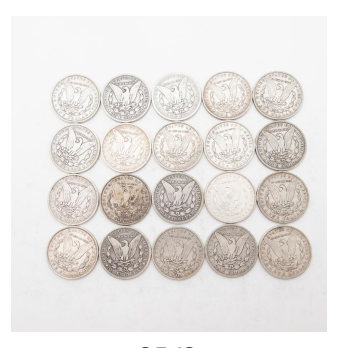
3543 Lot of 20 US Morgan Dollars Mixed Conditions 1887-17, 1888 -3. $300 / $400