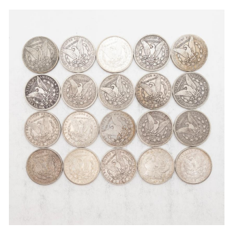
3546 Lot of 20 US Morgan Dollars, Mixed Condition, Including 1890-2, 1891-18. $300 / $400