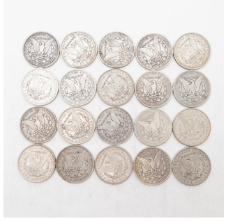
3547 Lot of 20 US Morgan Dollars, Mixed Condition, Including 1891-11, 1892 (O)-7, 1894(O)-2. $300 / $400