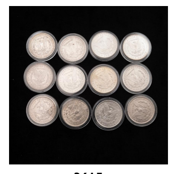
3615 US Morgan Dollars (12) Including 1879, 1881, 1884, 1886-2, 1890, 1900 -2, 1903, 1921-2, Choice UNC Condition. $400 / $500