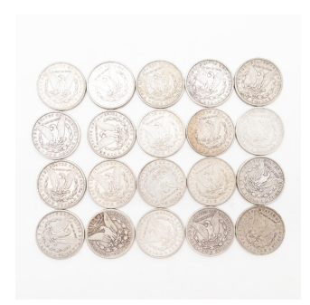
3540 Lot of 20 US Morgan Dollars Mixed Conditions 1878-4, 1879 -2, 1880-2, 1882-4, 1883 -3, 1884-5. $300 / $400