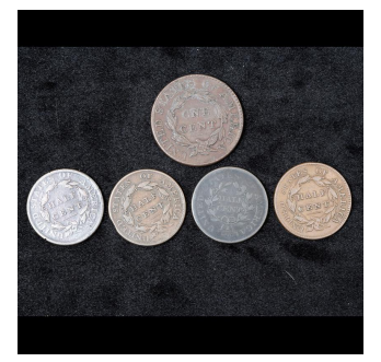
3639 US Coins Including Half Cents, 1804- VG, 1809-VG, 1826-F, 1828-F and Large Cent 1826 XF $300 / $400