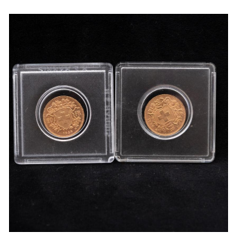
3582 Switzerland 1935 (B) 40 Franks Two Gold Coins, UNC Condition $700 / $800