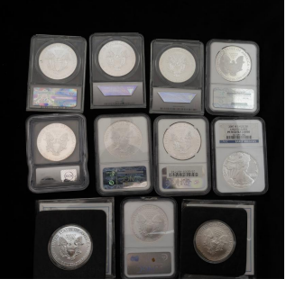
3642 US $1.00 Silver Eagle Coins (11) Including 2006 UNC 2007 W PR 70, 2007 UNC 2010 MS 69, 2011 (S) MS 70, 2012 MS 70, 2012 (S) PR 69, 2012 UNC, 2013 W SP 70, 2014 MS 70 and 2016 MS 70. $300 / $400