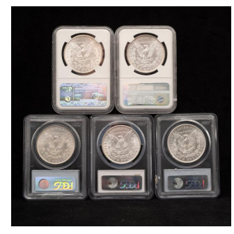
3636 US Morgan Dollars (5) 1879 AU 58, 1883 (O) MS63, 1900 (O) MS64, 1902 (O) MS64, and 1904 (O) MS63 $300 / $400