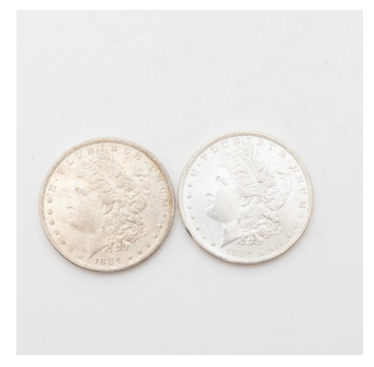
3536 US Roll of 20 1884 (O) Morgan Dollar UNC Condition. $600 / $700