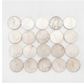
3553 US Roll of 20 1922 Peace Dollars, Mixed Conditions. $300 / $400