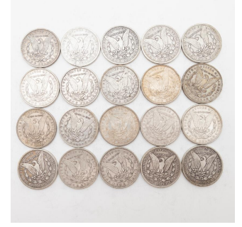
3545 Lot of 20 US Morgan Dollars, Mixed Condition, Including 1889-15, 1890-5. $300 / $400