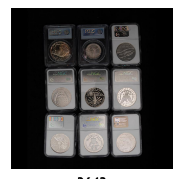
3643 US Silver Commemorative Coins (9) Including 1935 (S) San Diego MS 66, 1986 (S) Liberty PR 69, 1996 Smithsonian PR 69, 2000 L Ericson MS 69, 2001 Buffalo PR 69 D Cam, 2003 First Flight PF 69, 2004 Lewis and Clark MS 69, 2006 (S) Old Mint PR 69, 2008 Bald Eagle PR 69 $300 / $400