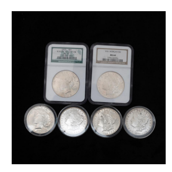
3635 US Morgan Dollar 1880 (S), 1899 (O), 1901 (O), Peace 1924; All Uncirculated Condition, Morgan 1921 MS64 ad Peace 1923 MS64 Total 6 Coins. $300 / $400