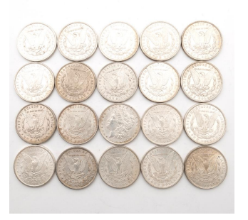
3557 US Morgan Dollars (20) AU-UNC Condition Including 1888-4, 1889, 1891, 1896-5, 1896 (O), 1897-2, 1898, 1900-4, 1900 (O). $600 / $700