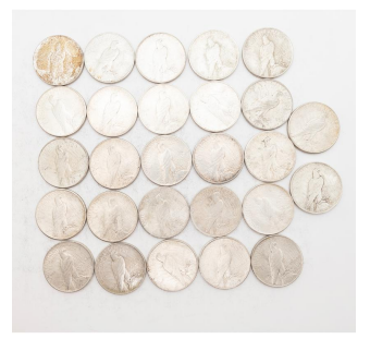
3560 US Peace Dollars (27) AU-UNC Condition Including 1922-14, 1923 -4, 1925-2, 1926 (S)-6. $550 / $650