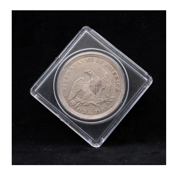
3626 US 1843 Liberty Seated One Dollar V Fine Condition. $350 / $450