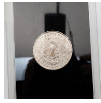
3563 US 1882 (CC) Morgan Dollar UNC with Box and COA. $300 / $400