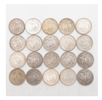
3549 Lot of 20 US Morgan Dollars, Mixed Condition, Including 1898-7, 1899-4, 1900-8, 1901-1. $300 / $400