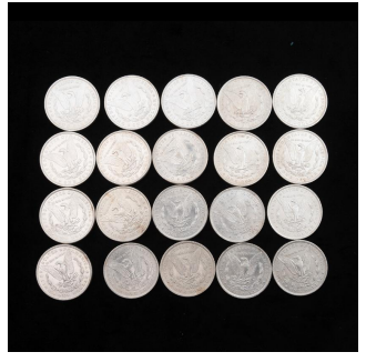
3647 Roll of 20 Morgan Dollars Including 1884 (O), 1885 (2), 1885 (O) -4, 1886, 1887-3, 1888, 1889, 1890, 1896-2, 1897, 1898-2, 1900. All in BU Condition $800 / $1000