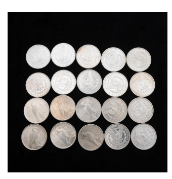
3648 US 20 Silver $1.00 Including Morgan 1879, 1880, 1880 (S), 1881(O), 1881(S), 1882 (O), 1883 (O), 1884 (O), 1885 (O) -2, 1886, 1887, Peace 1922-2, 1923-2, 1925, and 1935, $800 / $1000