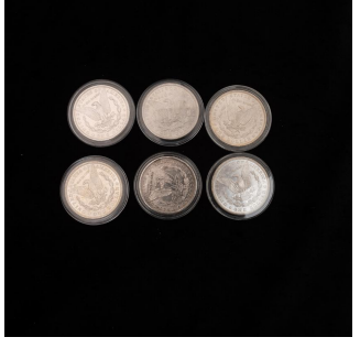
3614 US Morgan Dollars (6) Including 1880 (O), 1881 (S), 1885 (O), 1886 (S), 1904 (O), 1921 (D), All UNC Condition. $300 / $400