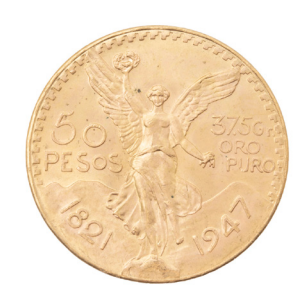
1947 Mexico 50 Pesos Gold Coin UNC Condition Lot 3586 Estimate: $1,800 / 2,000

Thursday, December 15; 10am - 5pm Friday, December 16; 9am - end of auction