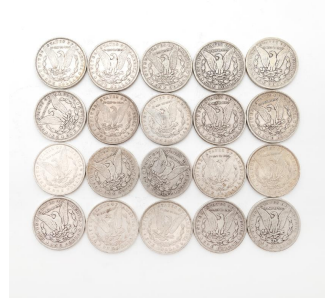
3538 Lot of 20 US Morgan Dollars Mixed Conditions Including 1878, 1878 (S) 1878 (CC), 1879, 1879 (O)-2, 1880-2, 1880(O), 1881 (O)-2, 1882(O)-2, 1883 (O)-2, 1883, 1884 (O)-2, 1884 (S)-2, $400 / $500