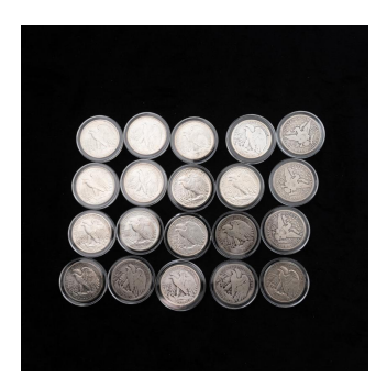
3618 US Half Dollars (20) Including Barber (3), Walking Liberty (17), All Common Dates, Mixed Conditions. $300 / $400