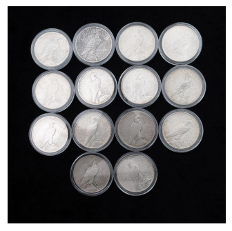
3617 US Peace Dollars (14) Common Dates, Mixed Conditions. $300 / $400