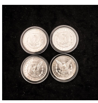
3613 US Morgan Dollars (4) Including 1881 (O), 1882 (S), 1884 (CC), and 1884 (O), All UNC Condition. $350 / $450