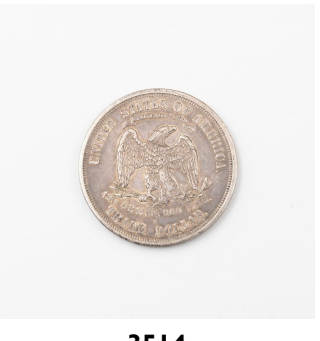
3514 US 1873(S) Trade Dollar EF Condition $400 / $500