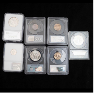
3633 US Certified Coins (7) Including 1865 3 Cent PCGS MS64, 1938 (D) 5 Cent PCGS MS66, 1938 (D/S) 5 Cent PCG MS 66, 1943 (D) 10 Cent MS65 FB, 1944 (S) Half Dollar GBU "Bugs Bunny", 1964 (D) Half Dollar Triple Die Obvers $400 / $500