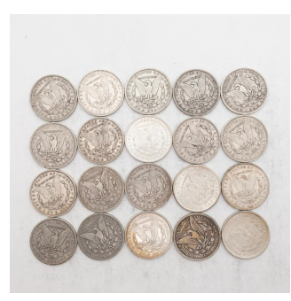
3544 Lot of 20 US Morgan Dollars Mixed Conditions 1888-7, 1889 -13. $300 / $400