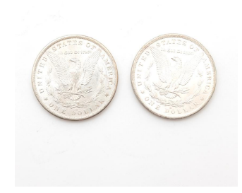
3527 US Lot of Two Rolls of 20 1884 (O) Morgan Dollars, UNC Condition. $1200 / $1400