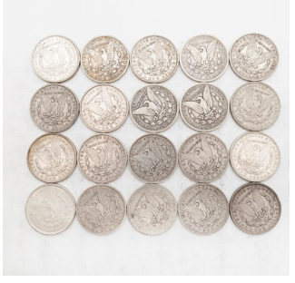
3542 Lot of 20 US Morgan Dollars Mixed Conditions 1886-16, 1887 -4. $300 / $400