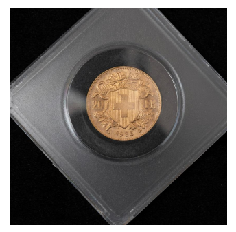
3608 Switzerland 1935 20 Franks Gold Coin UNC Condition $400 / $500