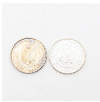
3532 US Lot of Two Rolls of 20 1884 (O) Morgan Dollars, UNC Condition. $1200 / $1400