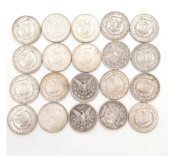
3539 Lot of 20 US Morgan Dollars Mixed Conditions Including 1878-4, 1879-4, 1880-4, 1881-3, 1882-5. $300 / $400