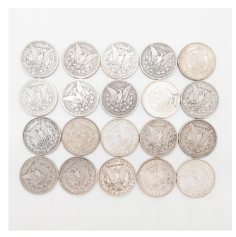
3541 Lot of 20 US Morgan Dollars Mixed Conditions 1882-4, 1883 -2, 1884-2, 1885-3, 1886 -5, 1887-4. $300 / $400