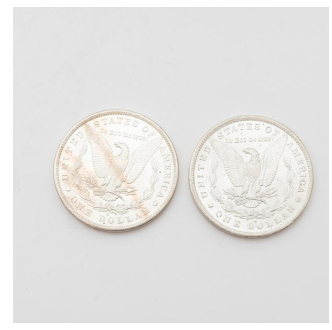
3534 US Lot of Two Rolls of 20 1884 (O) Morgan Dollars, UNC Condition. $1200 / $1400