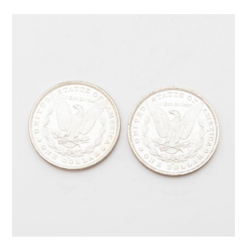
3531 US Lot of Two Rolls of 20 1884 (O) Morgan Dollars, UNC Condition. $1200 / $1400