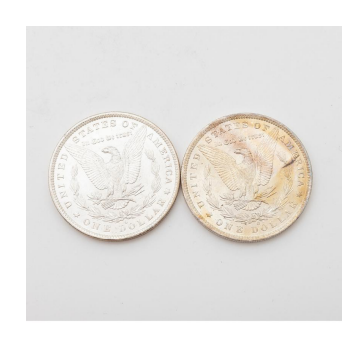
3535 US Lot of Two Rolls of 20 1884 (O) Morgan Dollars, UNC Condition. $1200 / $1400