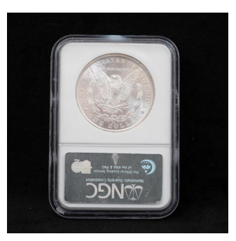
3628 US 1884 (CC) Morgan Dollar NGC MS63 $300 / $400