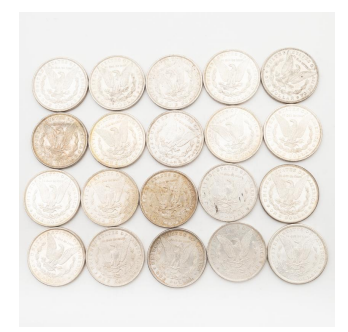
3555 US Morgan Dollars (20) AU-UNC Condition Including: 1878, 1878 (S), 1879 (O), 1880 (O), 1880 (S)-3, 1881 (S), 1882-2, 1882 (S)-4, 1882(O), 1883 (O)-5. $600 / $700