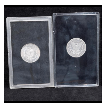
3632 US Morgan Dollars (2) 1883 (CC) Good and 1884 (CC) UNC Condition in Plastic Holders $400 / $500