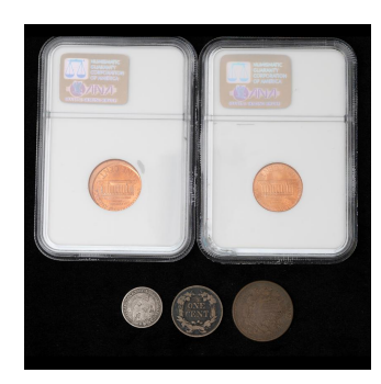
3640 US Coins Including Cents 1857-F, 1995 Doubled Die MS 68, 1999 of Center MS 65, Two Cent 1865-F and 1833 Half Dime VG $300 / $400