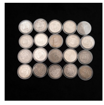
3616 US Morgan Dollars (20) Common Dates, Mixed Condition. $300 / $400