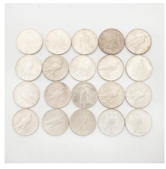
3559 US Peace Dollars (20) AU-UNC Condition Including 1922-10, 1925 -8, 1925(S)-2. $500 / $600