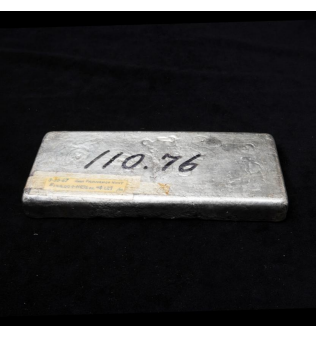
3602 Silver Bar Weighing 110.76 oz $1600 / $1800